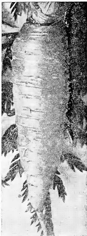
Danver's Half Long